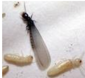
Swarmer and Workers