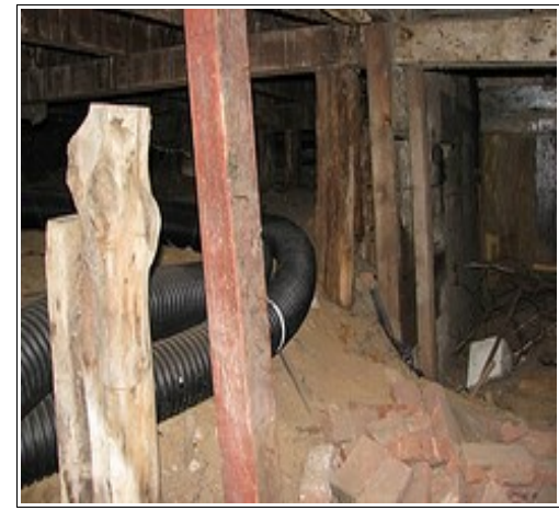
Extensive termite damage in a crawl space