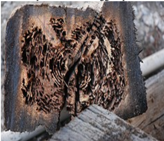
Termites eat wood from the inside out